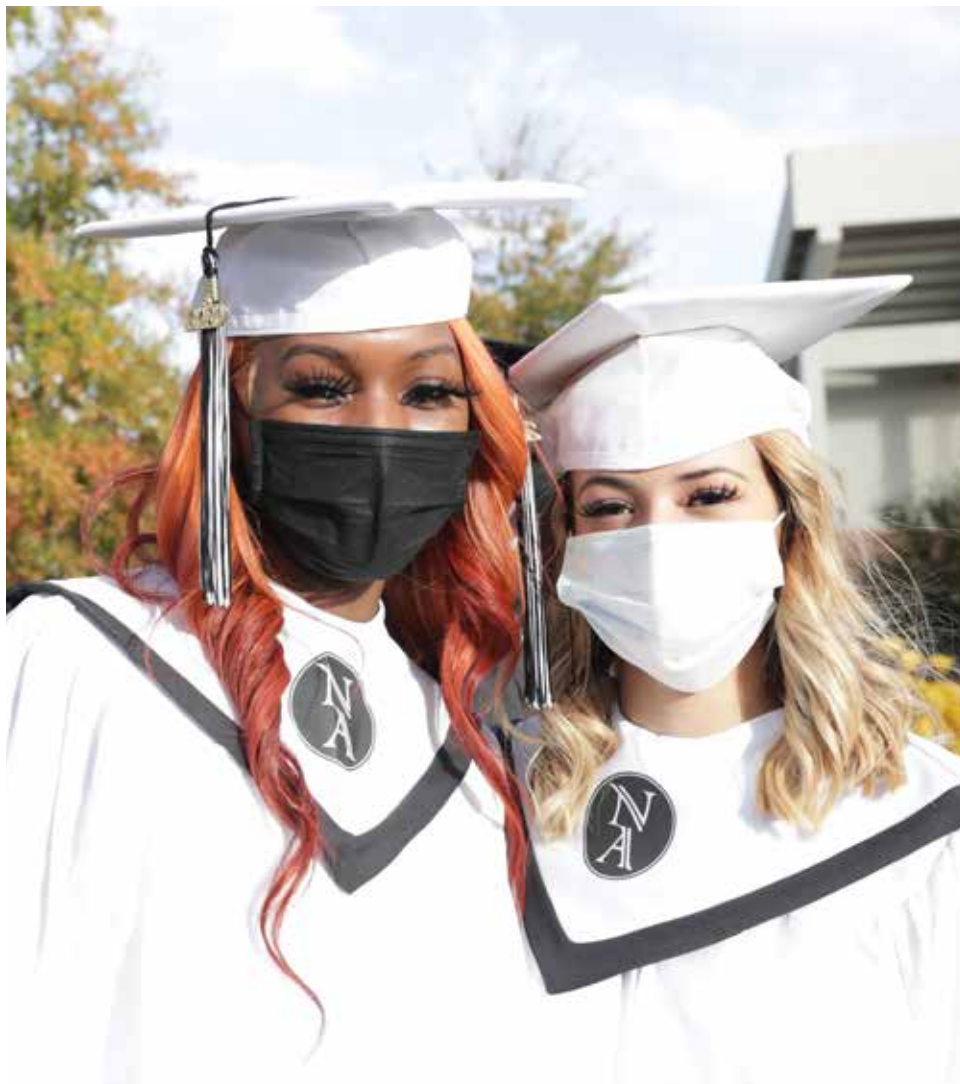
North Atlanta High School, Class of 2020