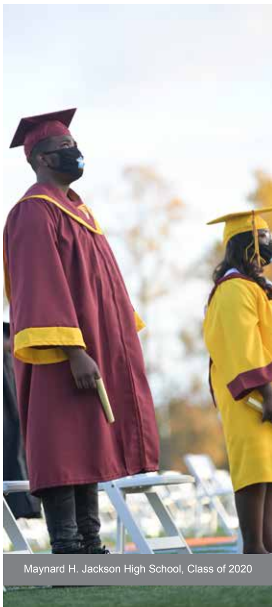
Maynard H. Jackson High School, Class of 2020

Questions? Send an email to APSGradNation@atlanta.k12.ga.us